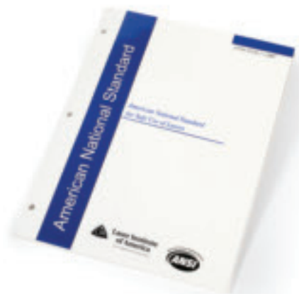
ANSI Z136.1 Safe Use of Lasers Standard

However, there have been OSHA citations issued relative to lasers using the authority vested under the "general duty clause" of Public Law 91-596; the Occupational Safety and Health Act of 1970. In these cases, the OSHA inspectors have asked the employers to revise their reportedly unsafe work-place using the recommendations and requirements of such industry consensus standards as the ANSI Z 136.1 Standard. For more information, see the Laser Safety and Health Topics Page at www.osha.gov .